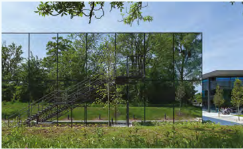
© Wilkinson Eyre / Dyson Research

In partnership with The Glass-House Community Led Design.